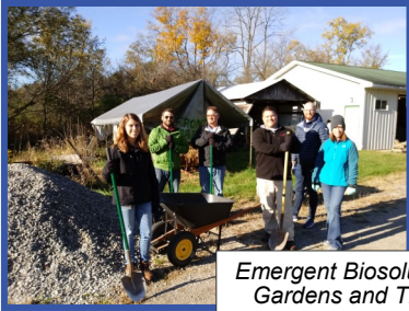
Emergent Biosolutions Gardens and Trails