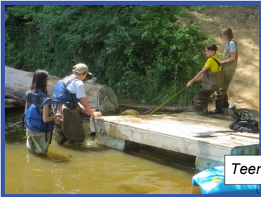
Teen Camp River Cleanup