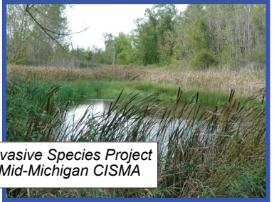
Invasive Species Project Mid-Michigan CISMA