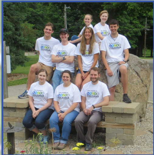
2018 Summer Camp Staff