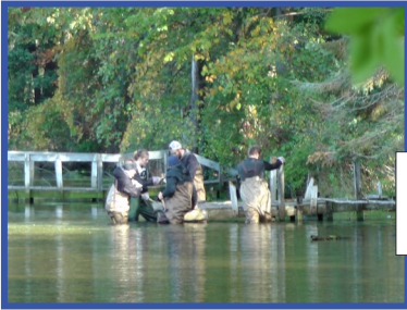
MSU Engineers Without Borders Dock Project