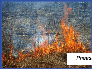
Pheasants Forever Prairie Burn